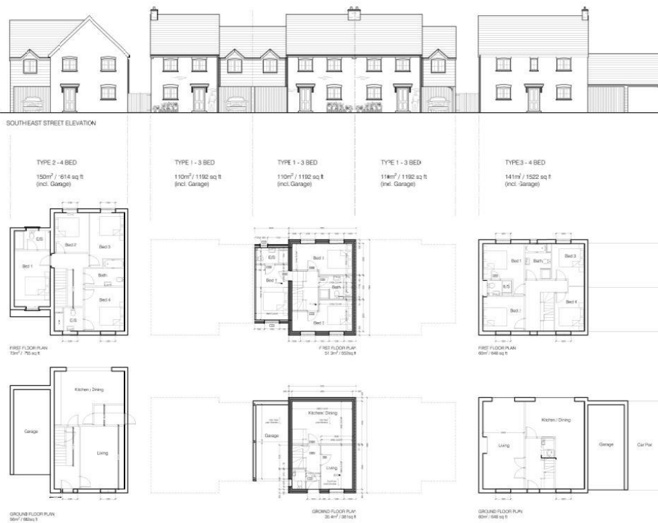
WRATTING CROFT - HOUSE TYPES (1:200 @ A3)

Viewing strictly by appointment with David Burr.