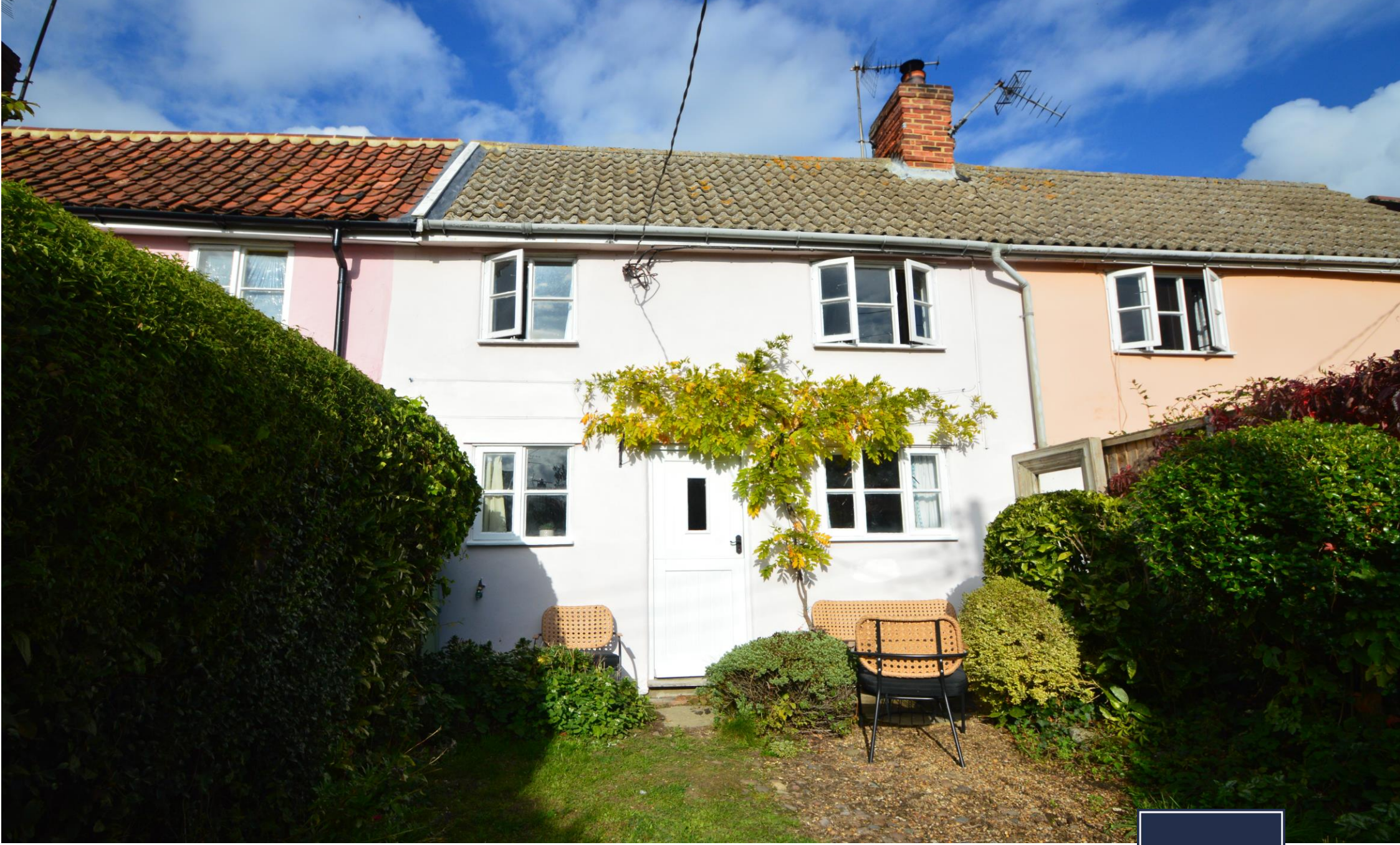
Marigold Cottage Poslingford, Suffolk