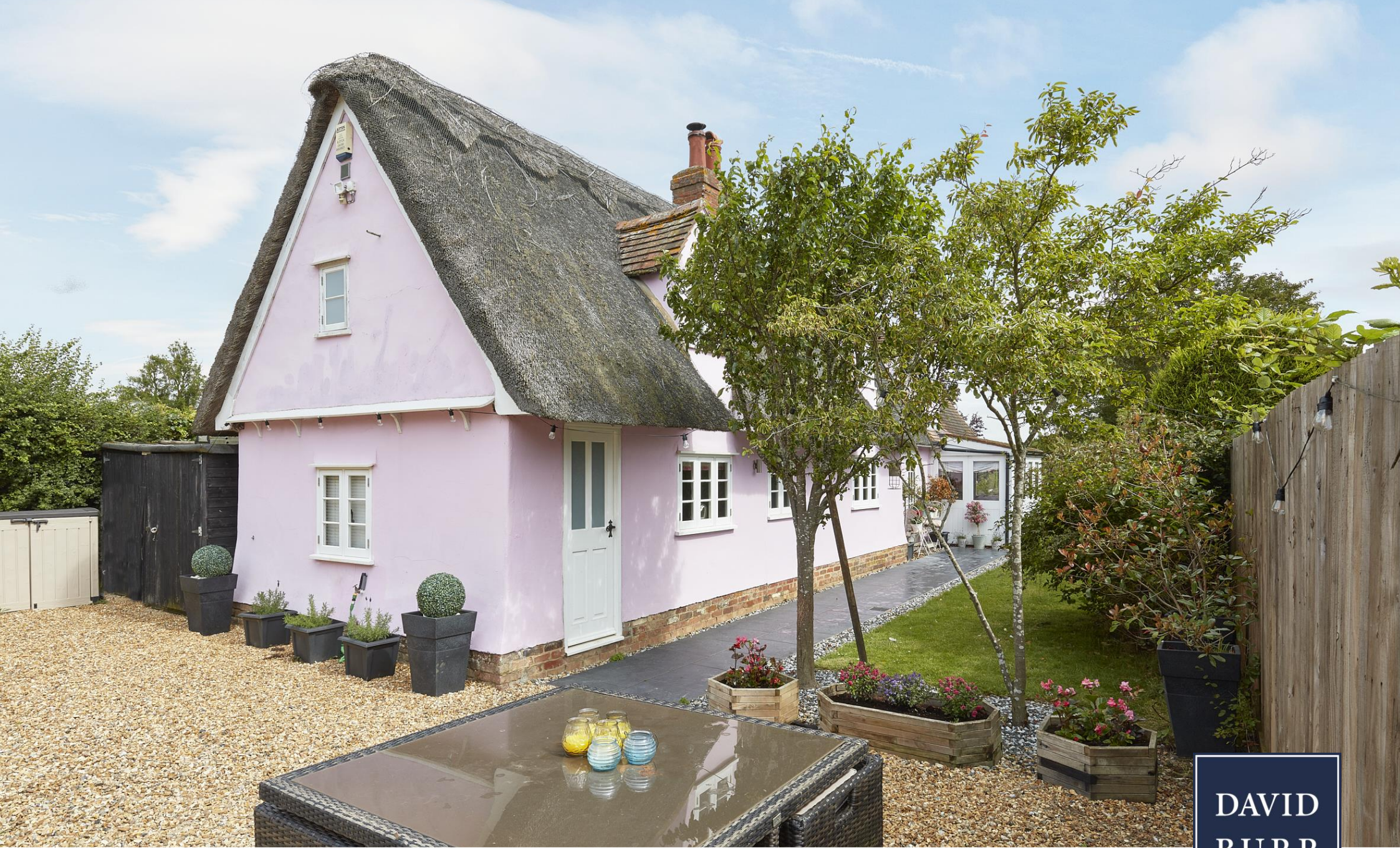
Yew Tree Cottage Kirtling, Cambridgeshire