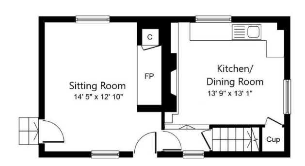
Ground Floor Approximate Floor Area 370 sq. ft.