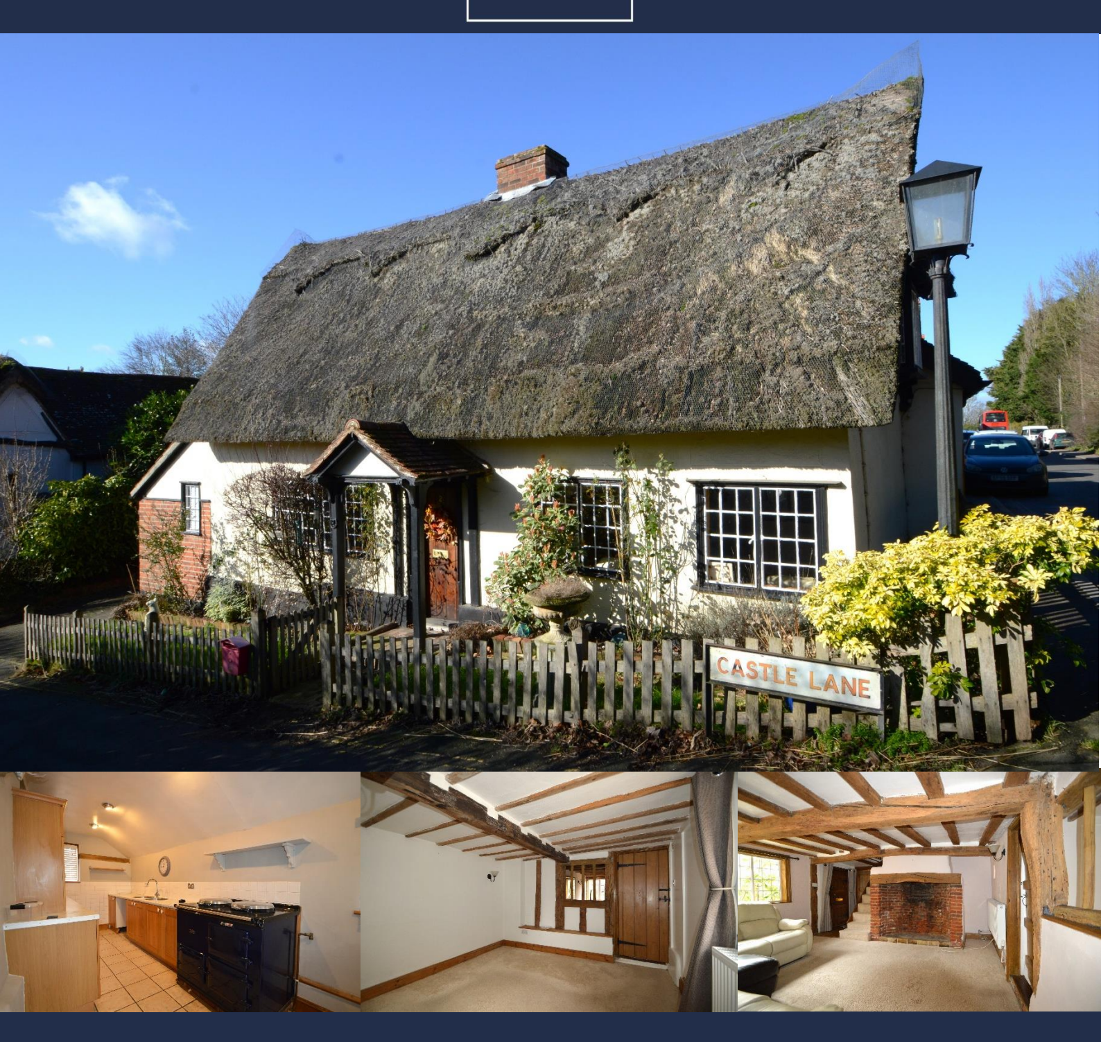
2 Castle Lane, Castle Hedingham, Halstead, CO9 3DL

2 Castle Lane is a delightful Grade II listed thatched property enjoying a superb location within the centre of this highly sought after and well served North Essex Village. The property has an abundance of characterful features throughout, yet is well suited to modern lifestyles and has generous gardens.