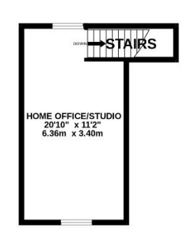
GROUND FLOOR 2023 sq.ft. (188.0 sq.m.) approx.