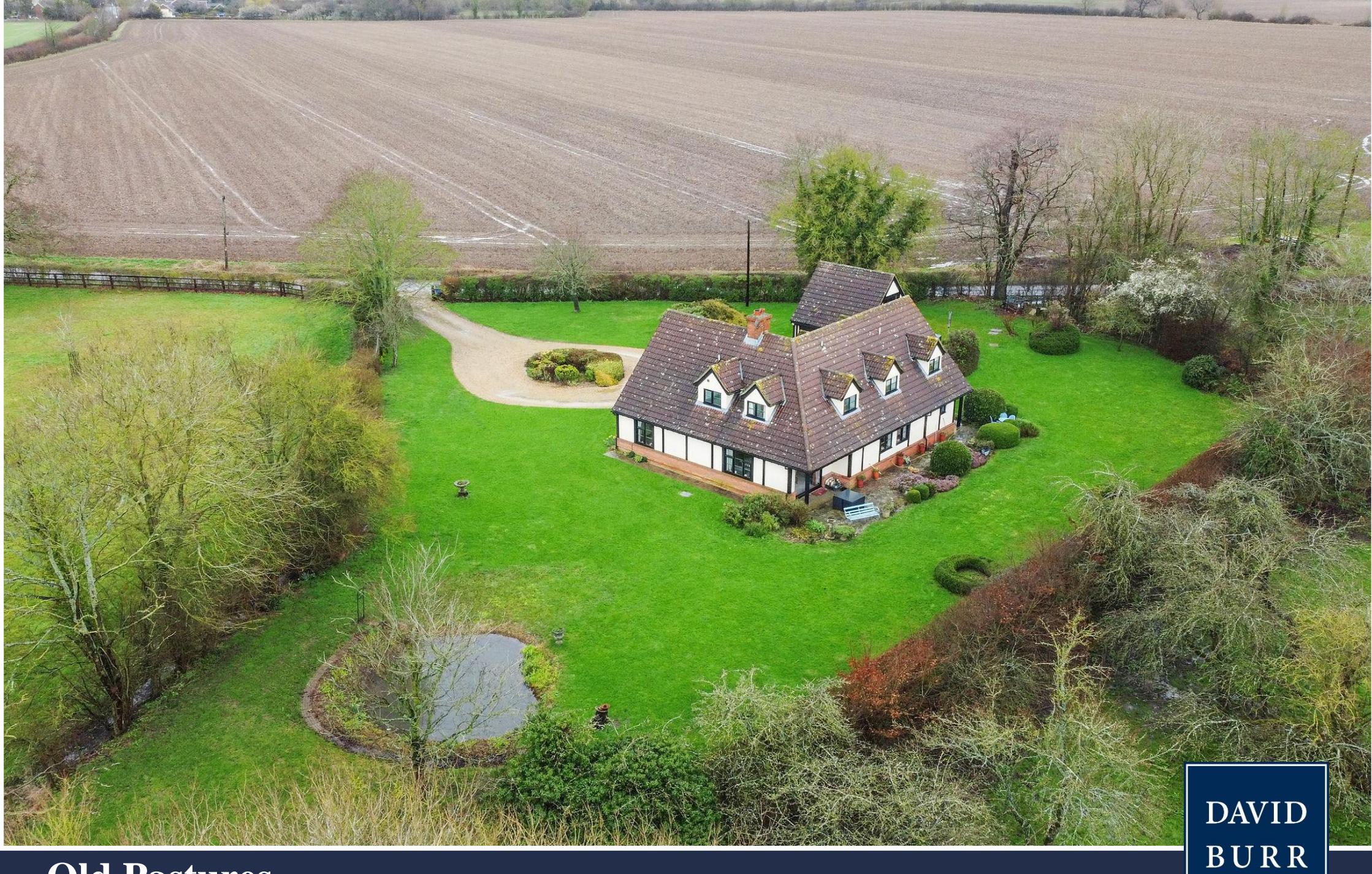
Old Pastures, Whepstead, Bury St. Edmunds, Suffolk.