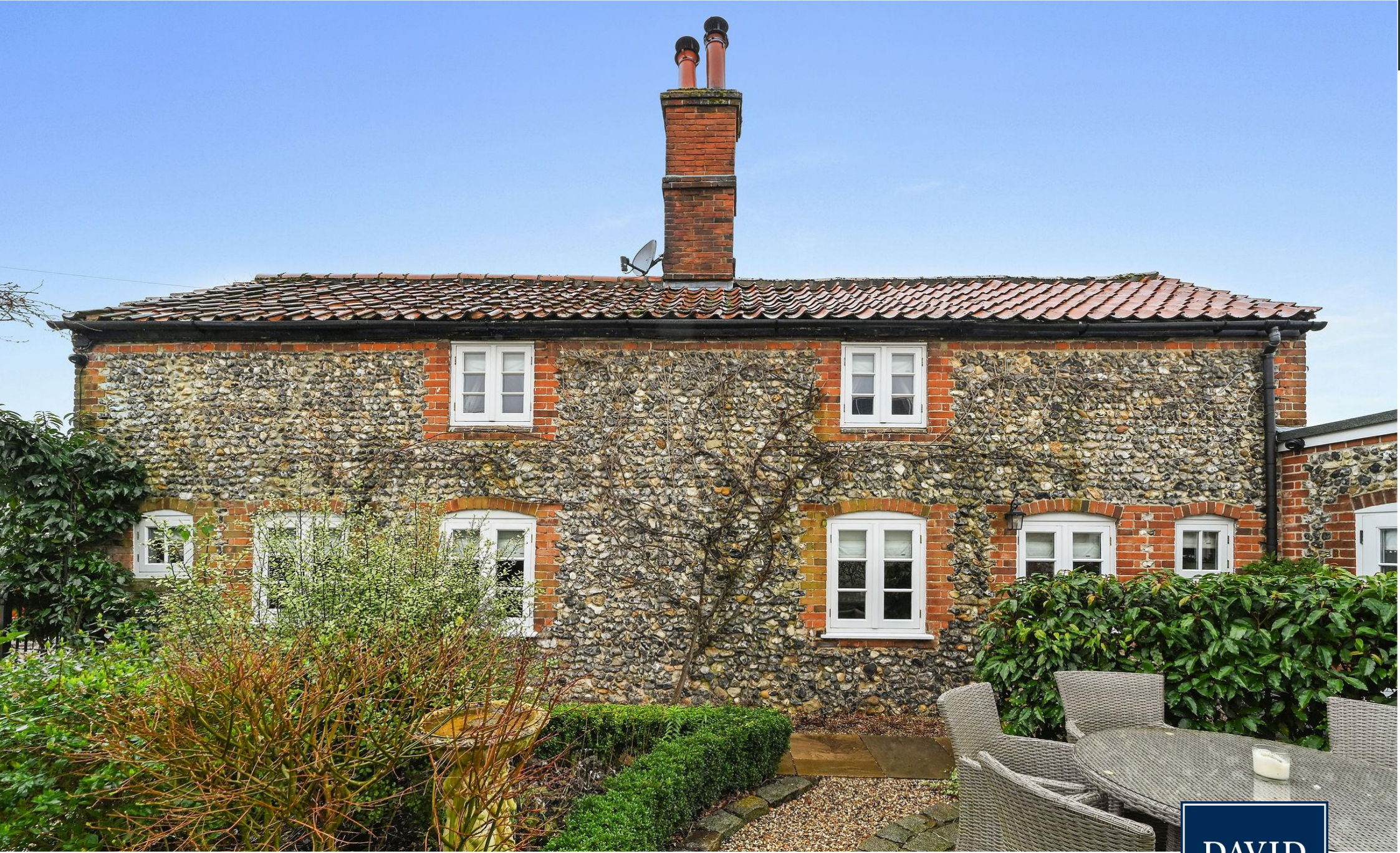
Dove Cottage, Barrow, Bury St. Edmunds, Suffolk.