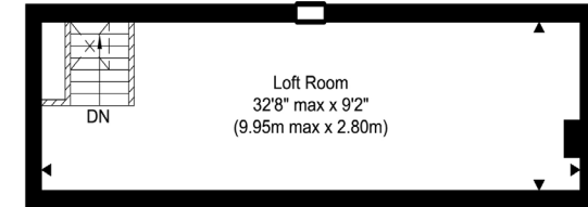
Second Floor Approximate Floor Area 307.20 sq. ft. (28.54 sq. m)

TOTAL APPROX. FLOOR AREA 2628.76 SQ.FT. (244.22 SQ.M.) Produced by www.chevronphotography.co.uk © 2023