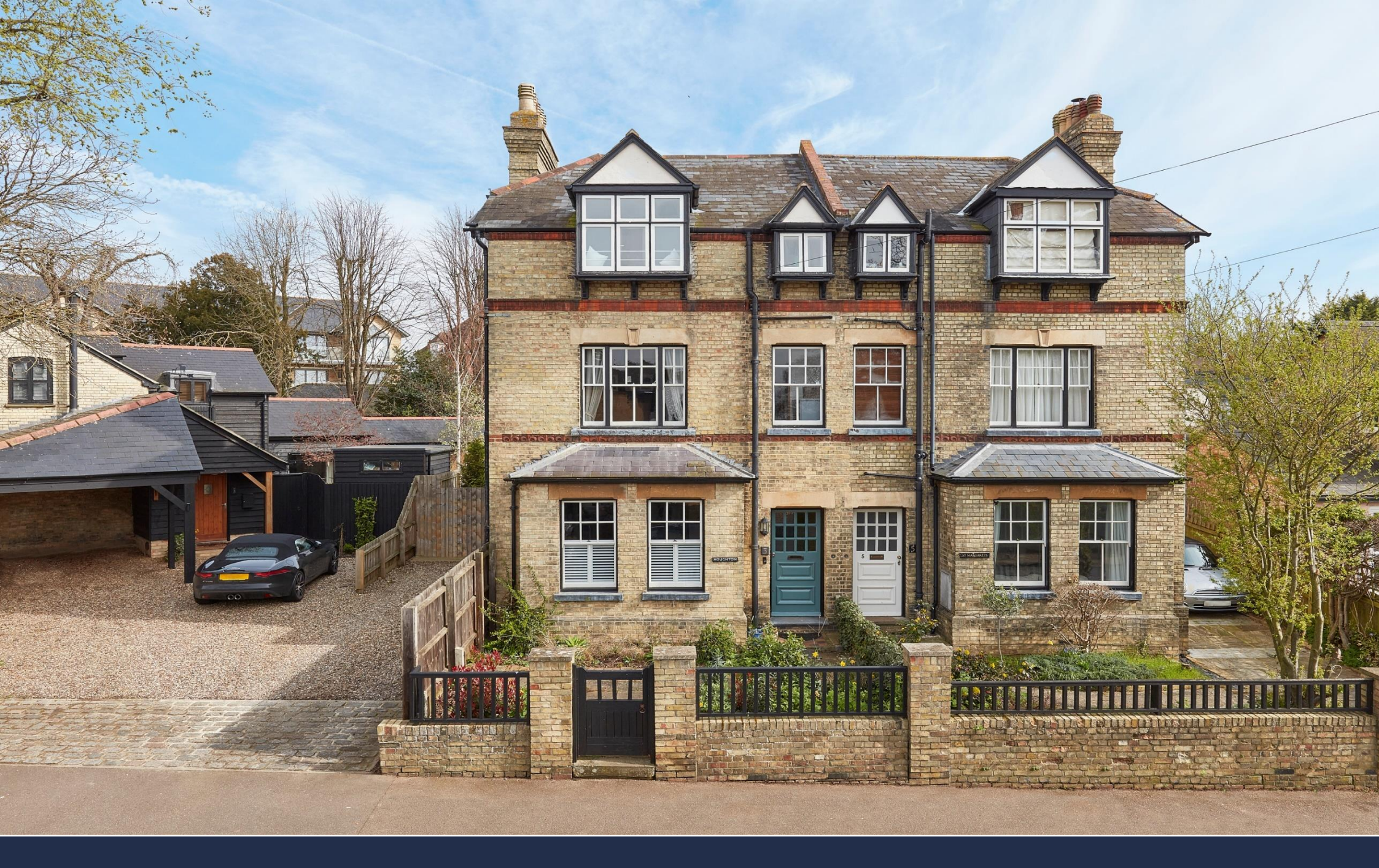
Houghton, 3 Cheveley Road Newmarket