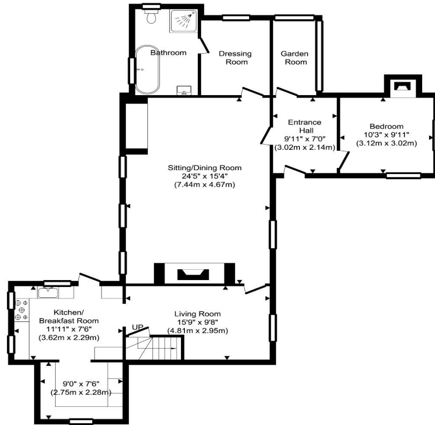
Ground Floor Approximate Floor Area 1127.95 sq. ft. (104.79 sq. m)