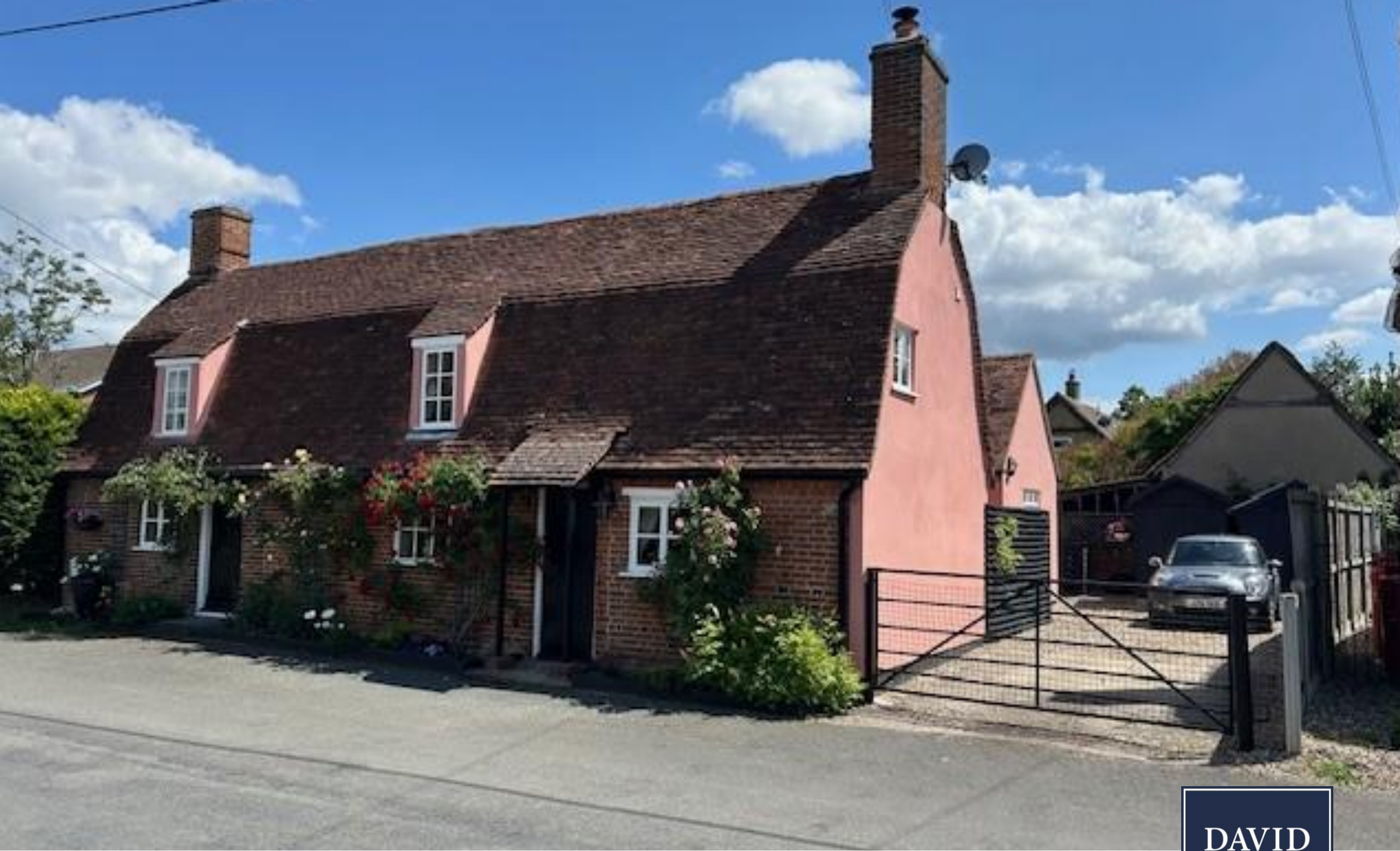
Hayward Cottage Newton Green, Suffolk